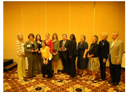
Growing Up Fit Together Outstanding Rural Health Program of the Year

LOUISIANA RURAL HEALTH ASSOCIATION POST OFFICE BOX 387-NAPOLÉONVILLE, LA 70390 PHONE: (985) 369-3813 FAX: (985) 369-3630 WEB: WWW.LRHA.ORG